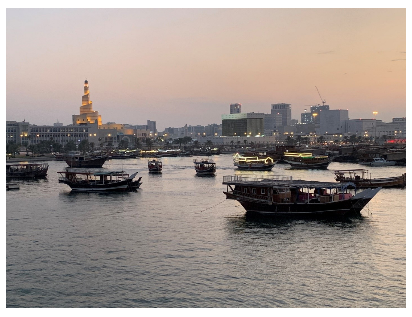
Doha, Qatar, at sunset

Qatar is a very small but very, very rich Arab country with the highest per capital income in the world. Located on the arid desert Arabian Peninsula coast, its neighbors are Saudi Arabia, the United Arab Emirates and Bahrain, with Iran just across the Persian Gulf. Off its coastline are the oil and massive amounts of gas which account for its wealth.