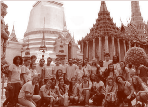
The Thailand Experiment in International Living group standing behind buildings in the Grand Palace of the King of Thailand.